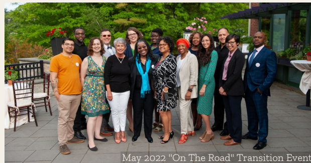
May 2022 "On The Road" Transition Event